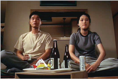
Art Museum by the Zoo (Lee Jeong-hyang, 1998)