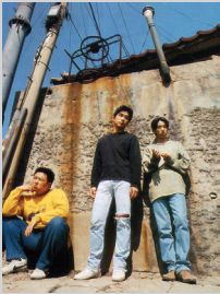
Three Friends (Lim Soon-rye, 1996)