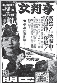
A Woman Judge (Hong Eun-won, 1962) Newspaper advertisement